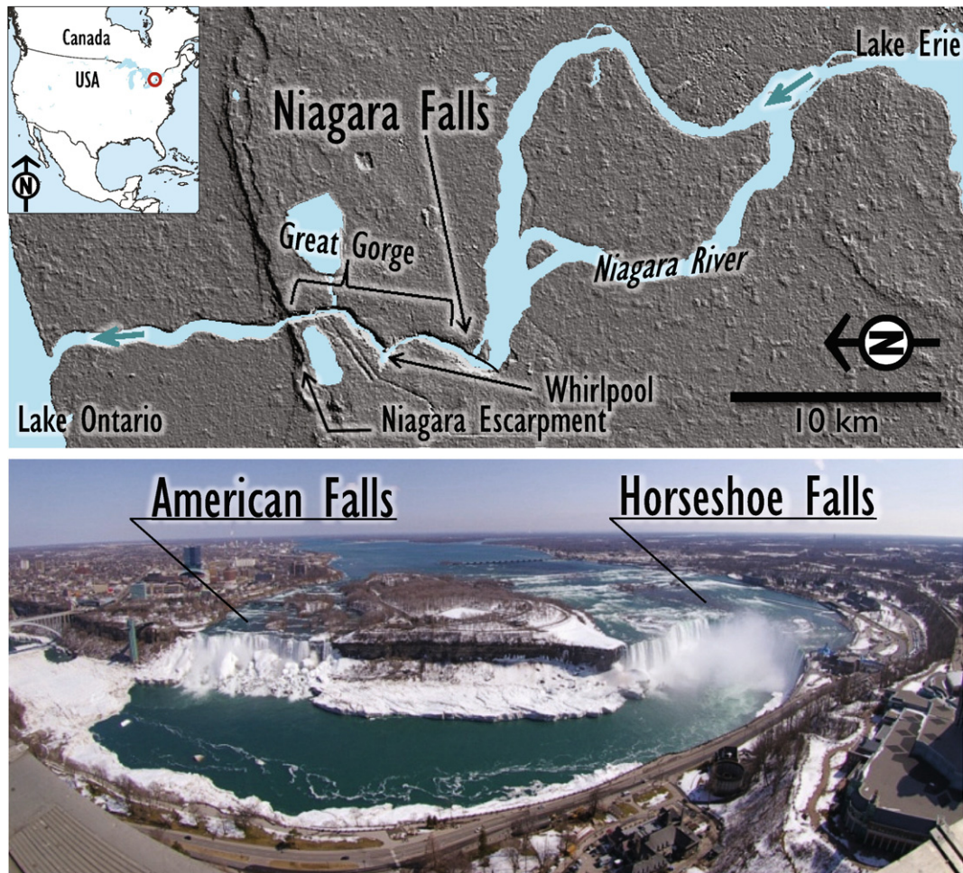
Fig. 1. Study site. Niagara Falls at present comprises two major falls, Horseshoe Falls and American Falls.

receded and the river started draining over the escarpment approximately 12,500 years ago (Tinkler et al., 1994). Since then the waterfall has receded for ca. 11 km, leaving a deep narrow gorge downstream, called the Great Gorge. The long-term mean recession rate of the waterfall is therefore approximately 1 \text{ m y}^{-1} , although the rate was considerably lower for about 5000 years during 10,500–5500 yBP (ca. 0.1 \text{ m y}^{-1} at minimum), due to the abrupt decrease of flow caused by water level lowering and changes in stream courses in the upstream lakes (Lewis and Anderson, 1989; Tinkler et al., 1994). The mean recession rate prior to that interval was similar to that after 5500 yBP (ca. 1.6 \text{ m y}^{-1} ).